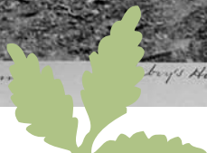
Boy's Hill, Fort Hill